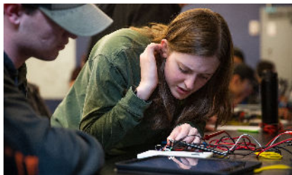
Electrical Engineering and Computer Science