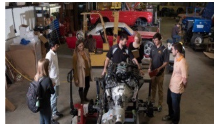
Mechanical, Aerospace, and Biomedical Engineering