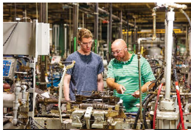
Materials Science and Engineering