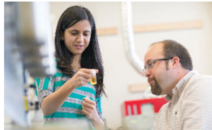
Chemical and Biomolecular Engineering