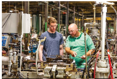
Materials Science and Engineering